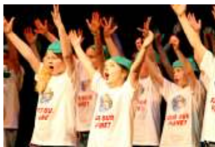
St Columba's PS, Clady

Ballykeel PS, Ballymena Carniny PS, Ballymena Fourtowns PS, Ahoghill The Country Playgroup, Ballymena