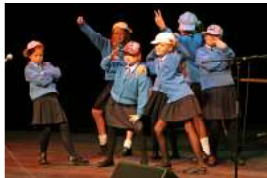
Star of the Sea PS