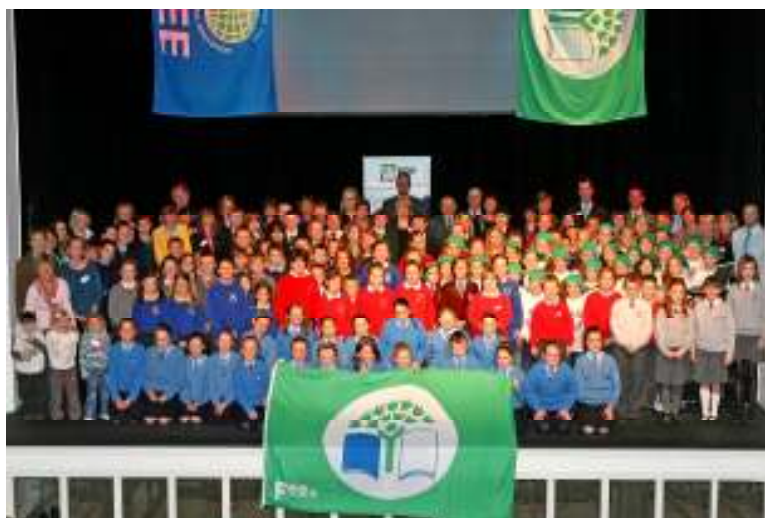
Green Flag schools at our "Celebrating Eco-Schools" event